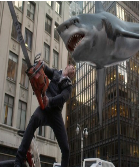
The main character of Sharknado preparing to slice a shark in half, with an oversized chainsaw.

Nothing is safe from the curse of the cheesy movie. Whether its bad concepts, bad editing, or ridiculous scenes, any movie can be affected. Even though they are bad, they often become "classics," and are watched over and over. Whether it be a tornado of sharks or a possessed serial killer doll, these movies will stick with you for a long time.