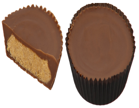
America's favorite Halloween candy, the Reese's Cup.

Halloween is rooted in the Irish holiday Samhein; however, our spooky holiday is practiced much differently. Samhein was believed to be the one day of the year where the veil between the worlds of the living and the dead were thinnest.