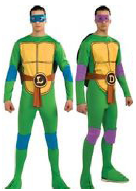
Teenage Mutant Ninja Turtles costumes