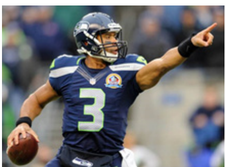
Just remember that even if your team is falling behind this year it does not mean things can change. Oakland, again, is a fantastic example. Although they are starting out 0-3, things can change for the Raiders. Same goes for every team. So if you have your favorite team, stick with them. Do not be another annoying fair weather fan.

Packers are playing in a game, I'm going to root for Chicago in that game. That does not mean that I am a Bears fan, I am simply just rooting for the team to defeat another in a game. That is not being a fair weather fan, that is simply hoping a team wins a match/game.